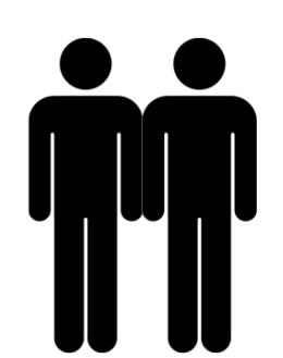
Men who have sex with men