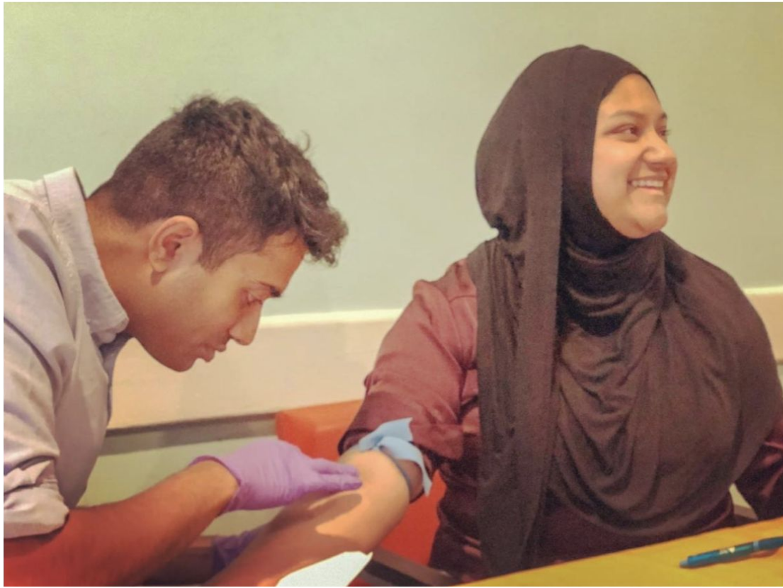
ASC staff providing testing at the Senegalese Association