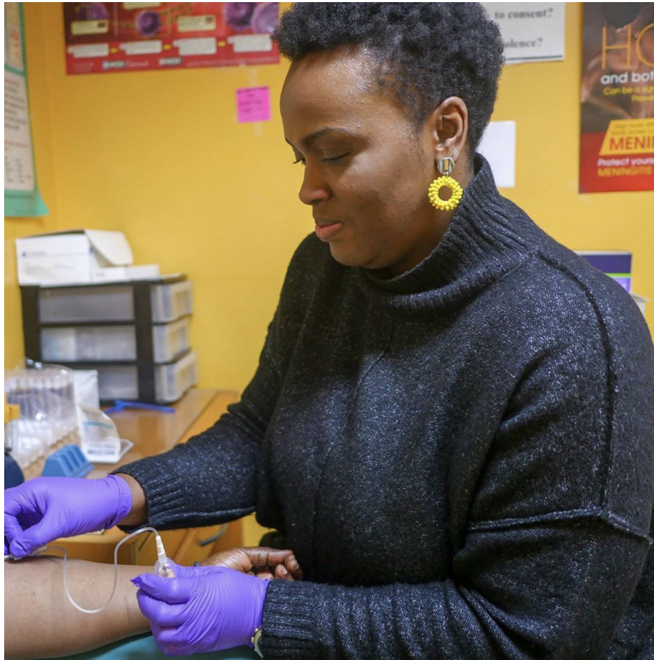
ASC staff providing testing at the ASC Office