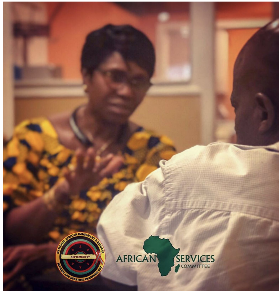
ASC Staff providing Hepatitis education at a local church