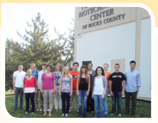
Our research training program is building the ranks of the next generation that includes high school and college summer internships; post-baccaluareate apprenticeships; and post-doctoral fellowships.

• Total serum glycan analysis is superior to lectin-ELISAs for the early detection of HCC