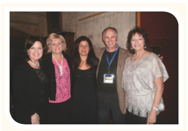
HBF coordinates the International HBV Meeting, which continues to be the only scientific meeting focused on hepatitis B. In 2012, the HBV Meeting was held in Oxford, UK.