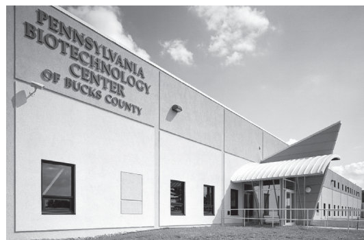
Created by the Hepatitis B Foundation to advance its research mission in 2006.