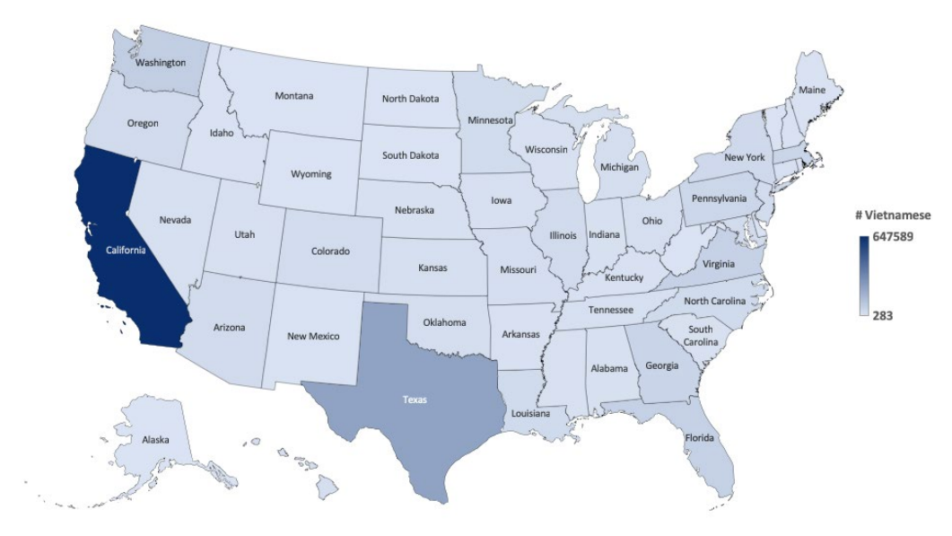
Figure 1. Geographic distribution of nail technicians in the U.S. *Data retrieved from Nails Magazine

be employee or commission-based, unlike typical non-Vietnamese-owned nail salons that offer booth rentals. Vietnamese-owned salons predominantly offer walk-in services, relying more on customer spontaneity and the convenience of a walk-in service to offer reduced prices<sup>15</sup>.