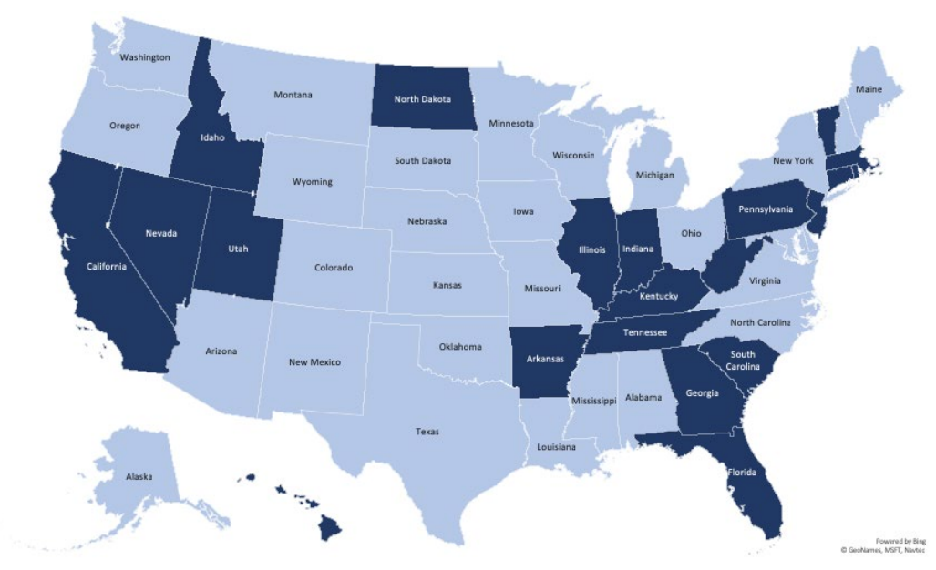
Figure 4. States that have a blood spill protocol. States shown in light blue have a blood spill protocol; states in dark blue do not.

also require an individual's HBV status to be disclosed when applying for licensure to work. While these states do not strictly prohibit these individuals from working, their clearance to work is left to the discretion of the cosmetology board or a physician. Without explicitly preventing people with hepatitis B from working, requiring individuals to disclose their status may effectively limit or intimidate individuals from entering this field, while further stigmatizing the disease.